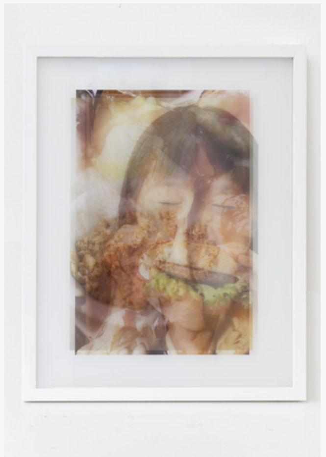
Inkjet prints on transparent paper (pictorico), series of 5, 50 x 40 cm