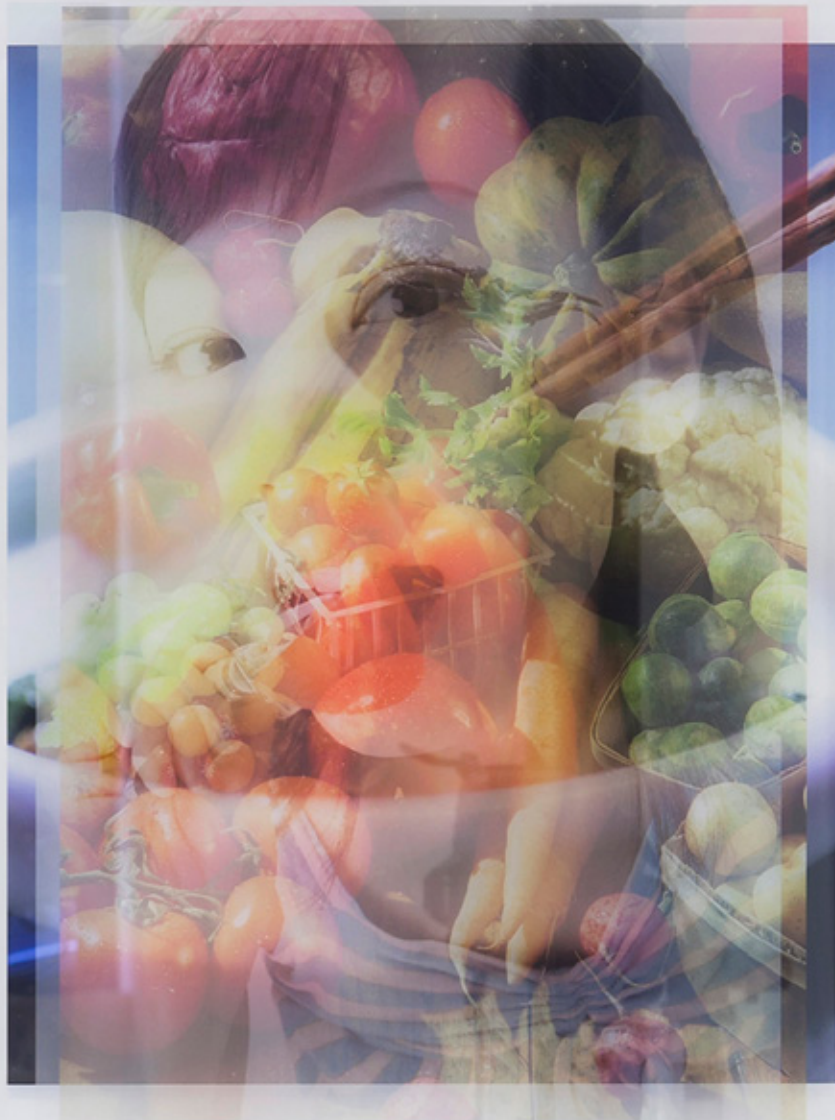
Inkjet prints on transparent paper (pictorico), series of 5, 50 x 40 cm