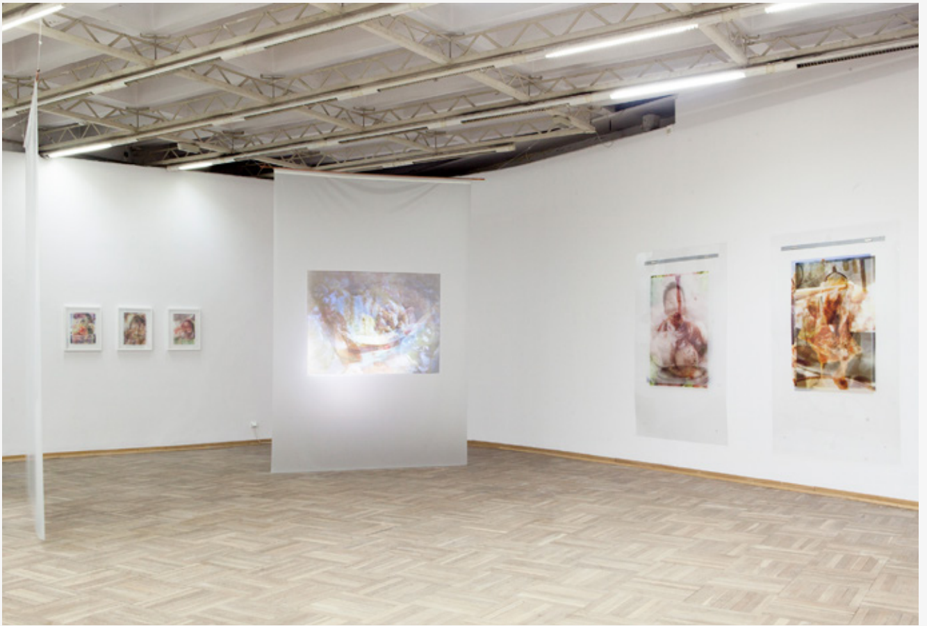
Installation views UV prints on PET film, series of 2, 200 x 120 cm