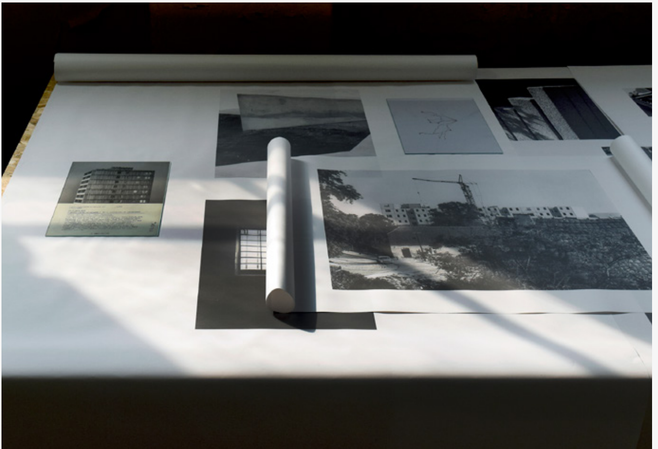
Installation view: Format Festival, Derby, UK