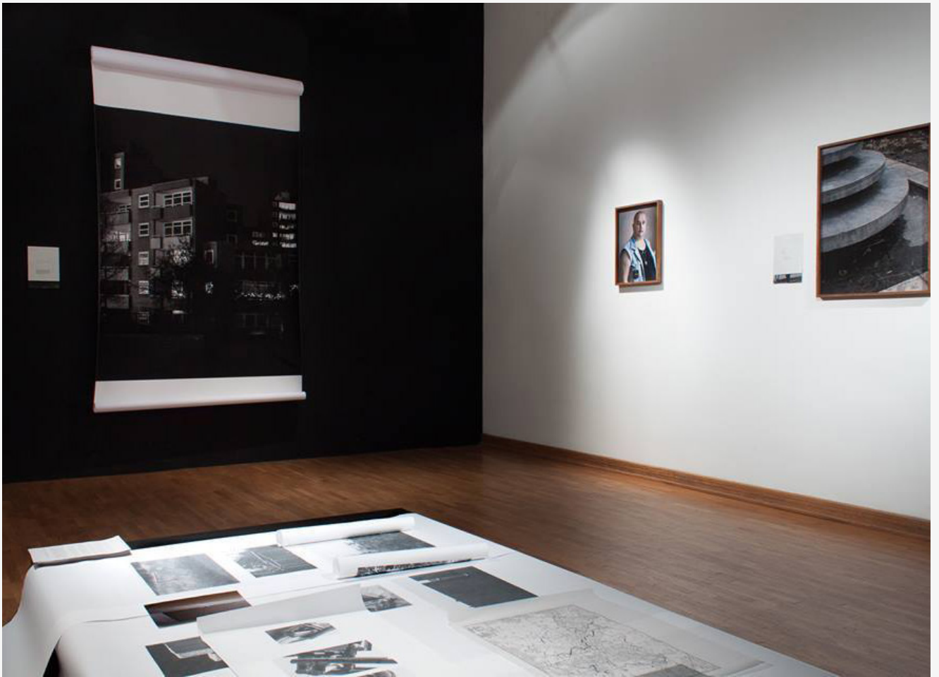
Installation view: Istituto Italiano di Cultura, Belgrade, Serbia