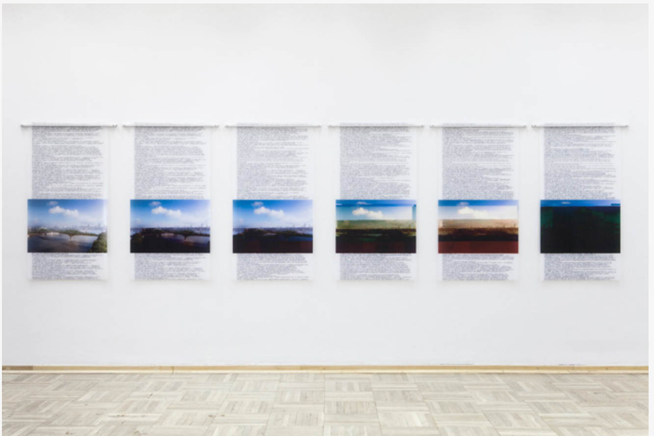
Installation view: Digital print on soft PVC translucent film, aluminium, 150 x 75 cm each