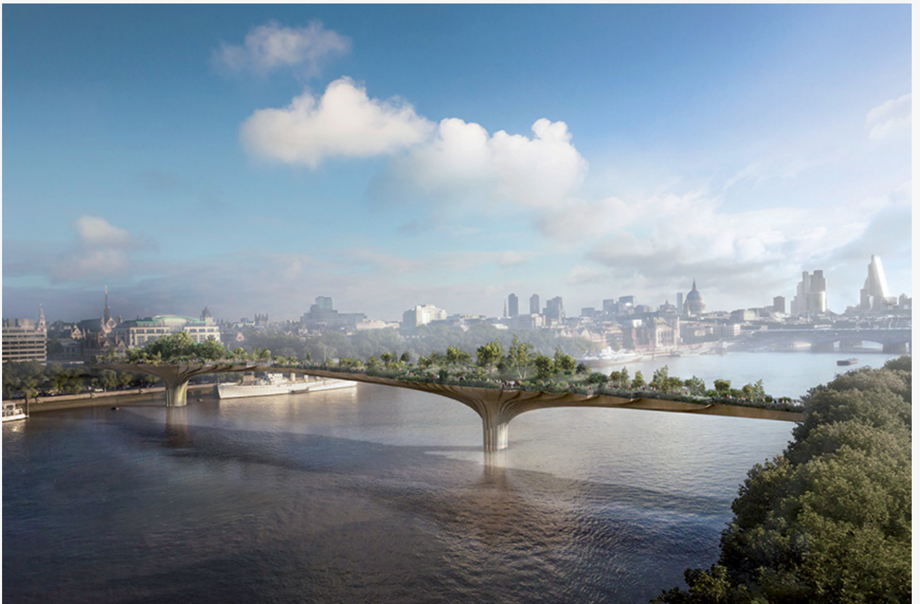
Digital rendering of the Garden Bridge