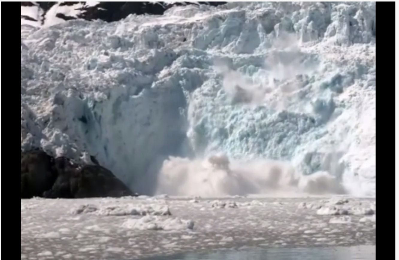
Video, 00:19:48, 2017 https://vimeo.com/148712732